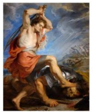
Children Sunday School Lessons on the Boy Prophet and the Shepherd-King